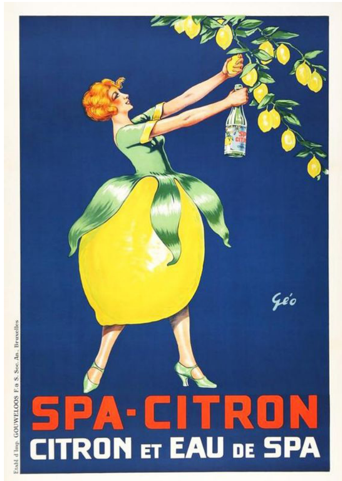
PIMLICO PRINTS (2020)

ESTABLISH A COLOUR SCHEME PRIOR TO COMPOSING YOUR COLLAGE. SEARCHING FOR COLOUR PALETTES ONLINE IS A GOOD WAY TO START. USE THIS COLOUR PALETTE AS A REFERENCE THROUGHOUT THE COLLAGE PROCESS.