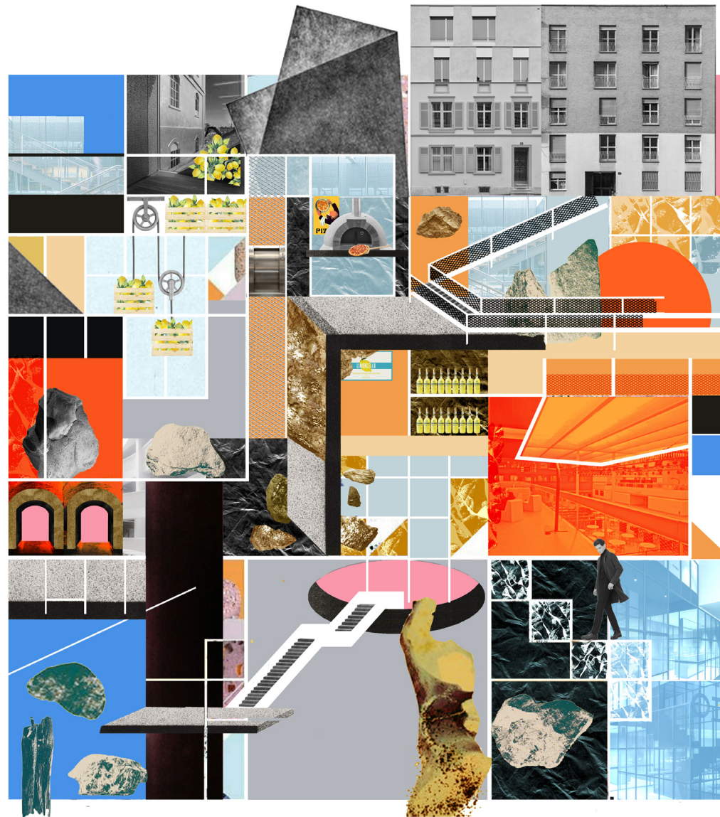
INTRODUCTION TO COLLAGE